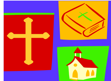
Bible Lessons/Praise & Worship