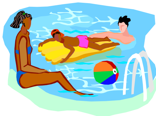
Swimming & Outdoor Activities